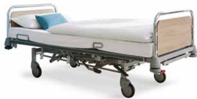
Deka with height adjustment The mechanical variant