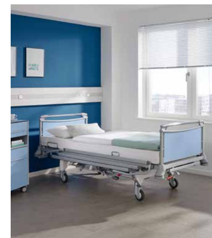
▲ The bars take up no extra space and leave room for sitting comfortably on the edge of the bed.