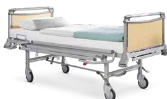
Deka without height adjustment The variant without height adjustment