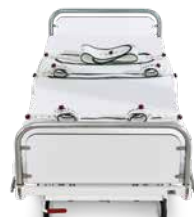
Deka Special beds for psychiatric care The variant for psychiatric care