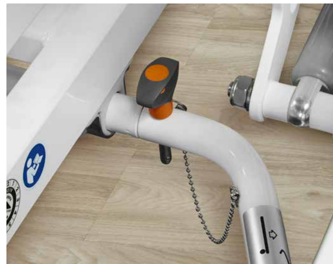
▲ Height pedal secured with a locking pin.