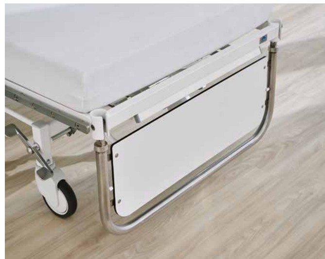
▲ Optional fold-down Classic footboard for easier access to the patient.

The bed offers a number of options in respect of ease of operation, restraint options and protection against misuse.