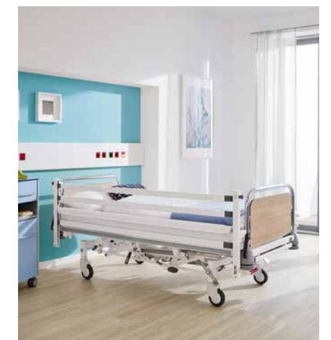
▲ Later conversion to a full-length safety side is possible as an option.