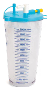
REF 4030F FLOVAC set consisting of secretion container, secretion bag, closure lid, and container holder