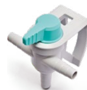
REF 4130nou Suction manifold for switching between the two secretion bottles, including connecting tubes, 8 x 3 x 400 mm