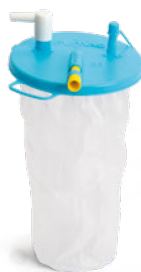
REF 4035F FLOVAC 2-liter disposable secretion bag with closure lid