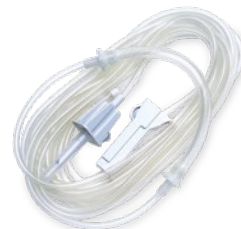
REF 6022 Disposable tube set for Dispenser DP 30 and DP 30 LipoPlus. PU: 10 pcs.