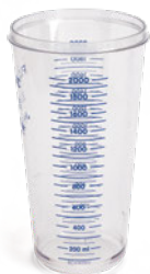
REF 4036F FLOVAC sterilizable 2-liter secretion container