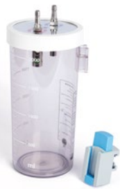
REF 4052nou 2-liter polysulfone secretion bottle with mounting bracket