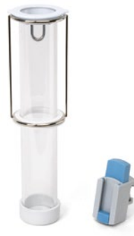
REF 4043 Quiver with connecting module for attachment to the hospital rail of the stand