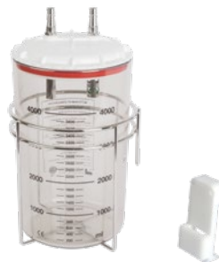
REF 4245nou 4-liter polysulfone secretion bottle with mounting bracket